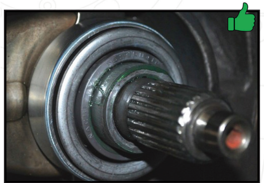
Example of PERFECT AMOUNT OF GREASE on the input shaft. As you can see, it is barely visible to the naked eye and acts as more of a lubricant.