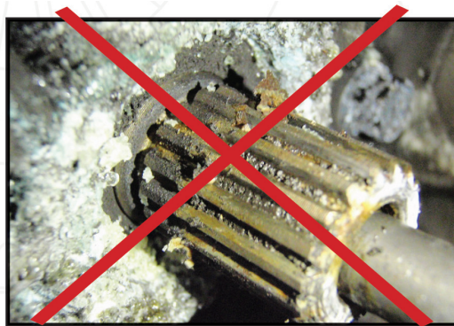
Example of TOO MUCH GREASE on input shaft which causes grease to spray all over the disc and ruin the disc material or pads.