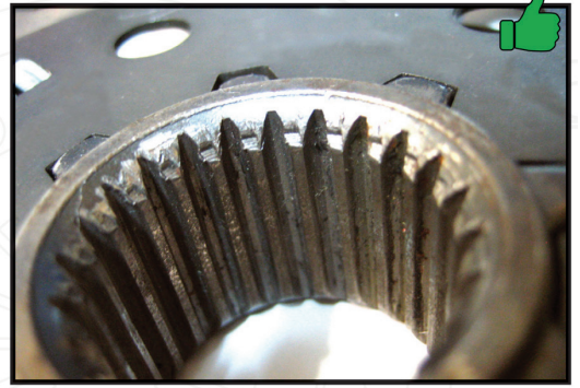
Example of PERFECT AMOUNT OF GREASE. As you can see, it is barely visible to the naked eye and acts as more of a lubricant.