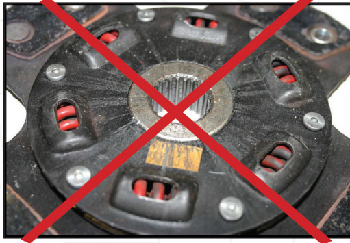
Example of TOO MUCH GREASE. Too much causes grease to spray all over the disc and ruins the disc material or pads.

If you have any questions or concerns, please feel free to contact the Tech Department at info@competitionclutch.com or call 800-869-6598